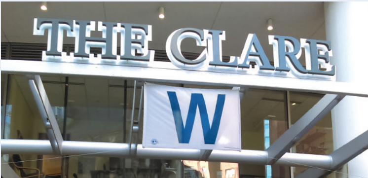
The W displayed proudly in front of The Clare.