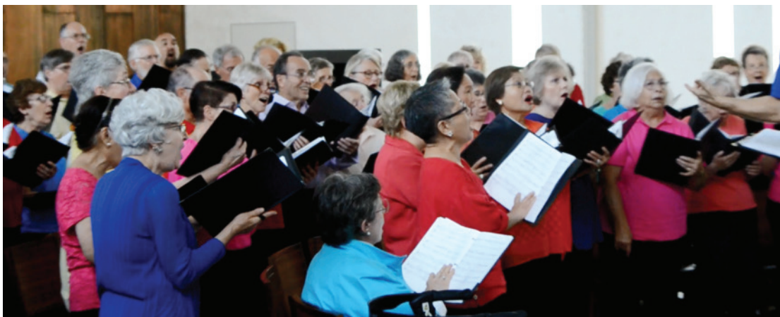
After their debut performance at The Clare, the Gold Coast Chorale came together with the other Chicago-area Chorales for a concert at Buchanan Chapel of Fourth Presbyterian Church.

The winter session will begin in January, and all Clare residents are invited to join. The more, the merrier! Registration details will be forthcoming. For more information on the Encore initiative in general, go to www.encore.illinois.org . ●