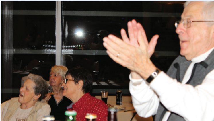
Surprise, worry, wonder, and cheers all at once!