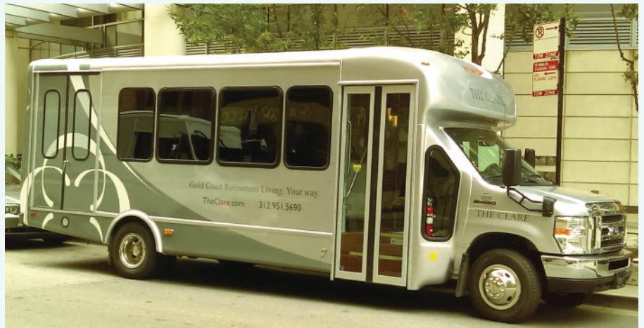
The new and larger Clare bus has arrived!