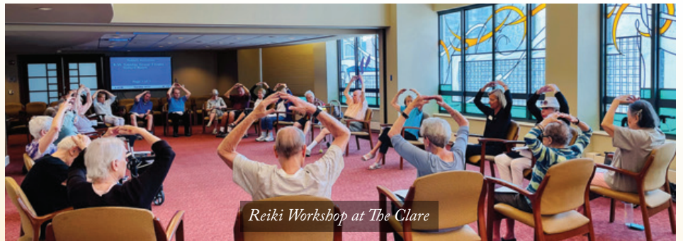
Reiki Workshop at The Clare