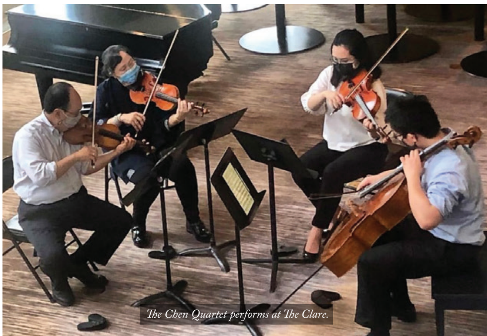
The Chen Quartet performs at The Clare.